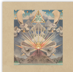
JUNIP FIELDS CD